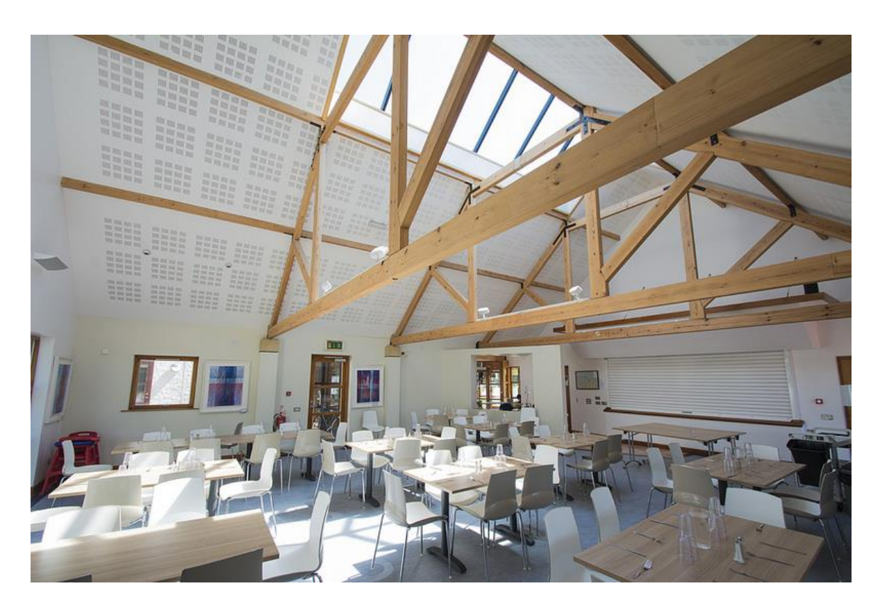
Figure 1: The dining hall at Corrymeela's Ballycastle Centre

The dining hall is set up in tables of six, and there is an unofficial policy encouraging staff and volunteers to sit with different groups as a means of promoting interactions (Personal Observations 2009, 2017, 2018; Martin 2017). There were various examples of bridging capital being initiated by inter-group mixing during mealtimes. I established many relationships from sitting with strangers and getting to know them over a meal. In one instance, I made connections with a visiting Rabbi from Israel, resulting in a free lift to Dublin and an invite to visit his peace centre if I was ever in Jerusalem. This type of interaction was commonplace. Martha Martin encouraged her participants to mix with people they didn't know and observed that a number of them blended well with the other groups present onsite (Martin 2017). On the power of this tradition, she stated: