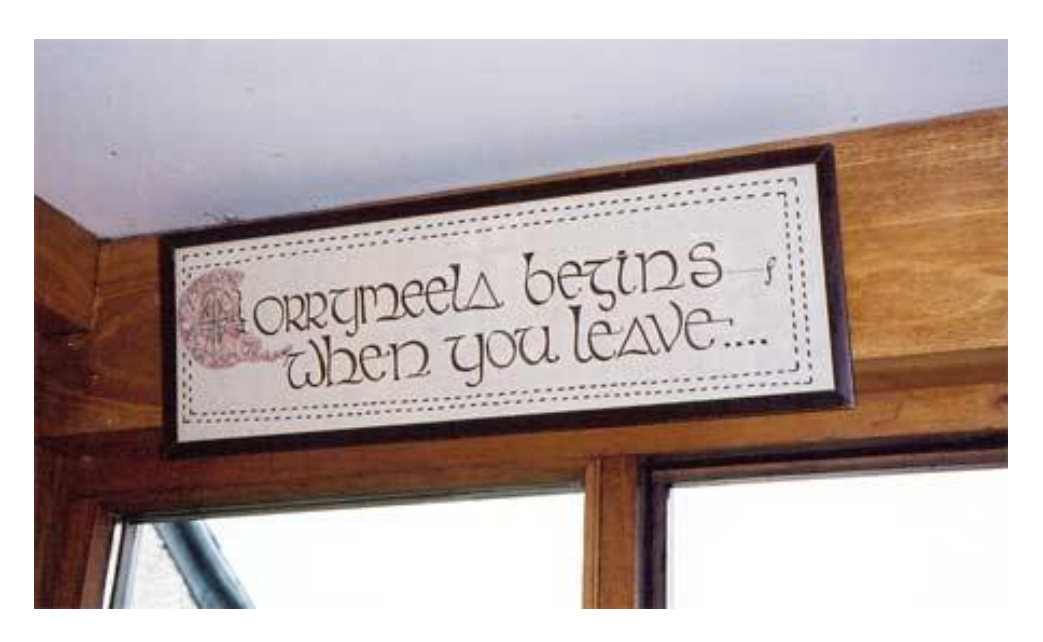
Figure 2: Sign above the main entrance to the Main House at the Ballycastle Centre

Corrymeela is explicit about its intention to extend its culture and ideas beyond the Community. A sign above the exit in the Main House at the Ballycastle Centre states "Corrymeela begins when you leave" (see Figure 2 below).